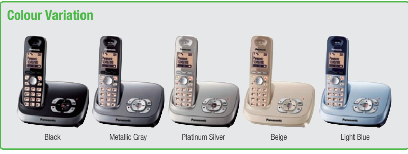
Note: Some colours may not be available in your area.