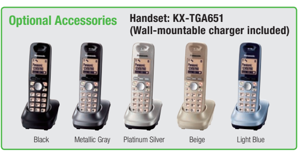
Note: Some colours may not be available in your area.